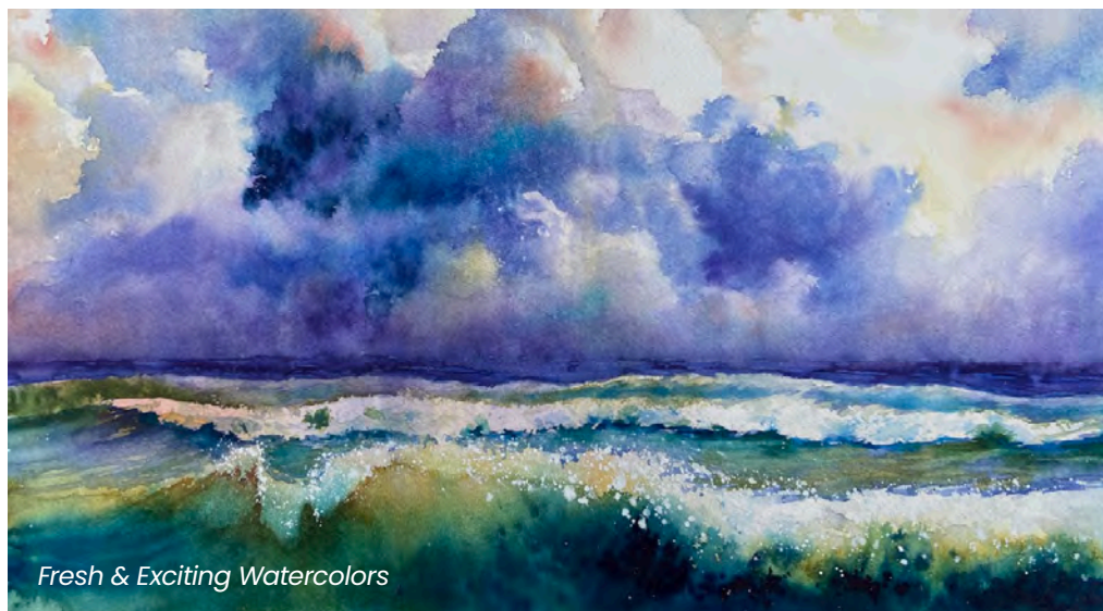
Fresh & Exciting Watercolors