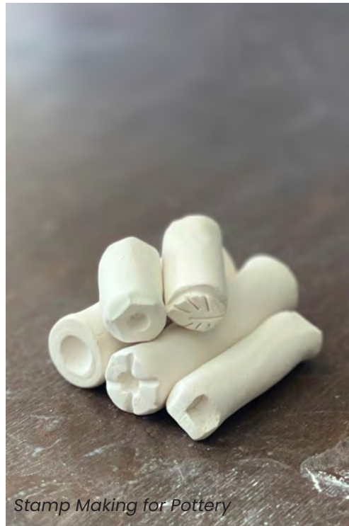
Stamp Making for Pottery