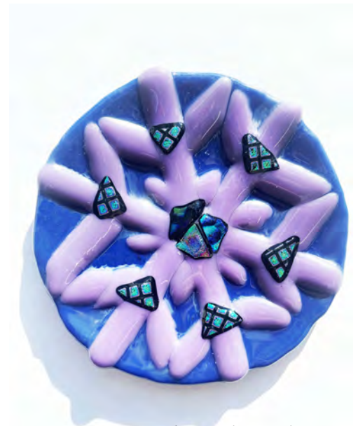
Fused Glass Snowflake Trinket Dish