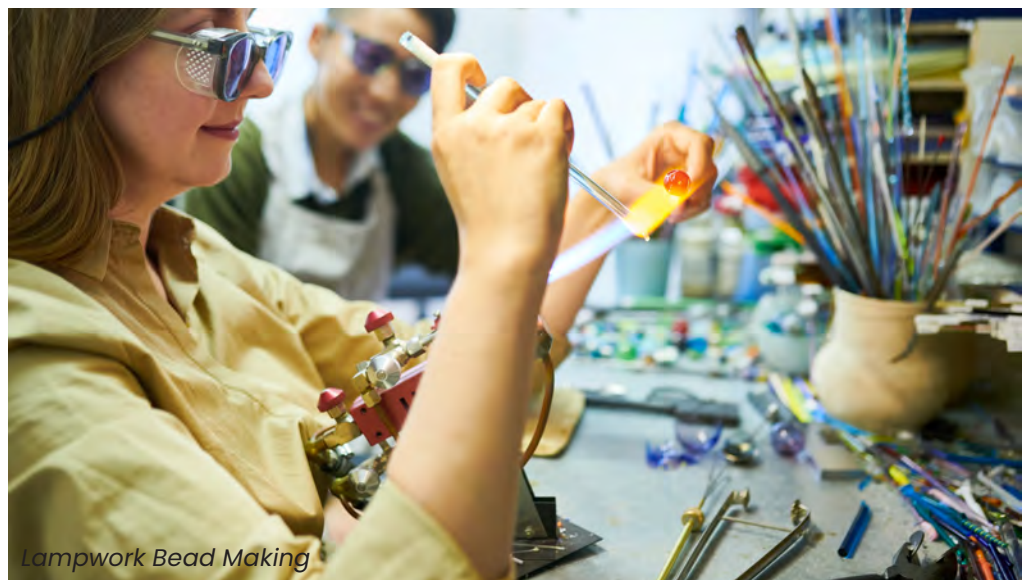
Lampwork Bead Making