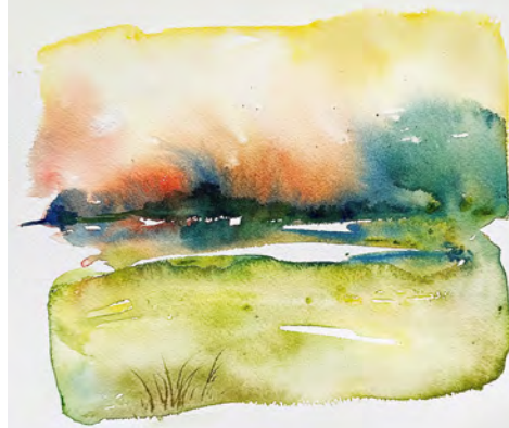
Fun with Watercolor & Acrylic Ink